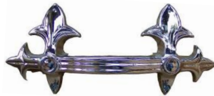
Set of Three Nickel Finished Fleur Handles.