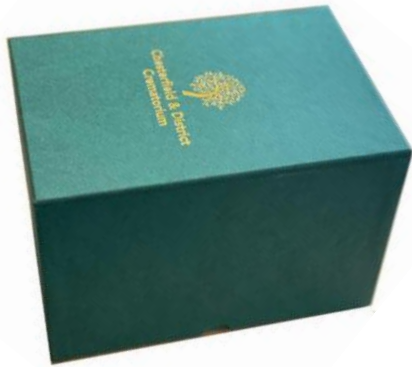
with Crematorium Box £55