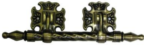
Set of Three Antique Brass Bar Handles, and T-ends £195:00