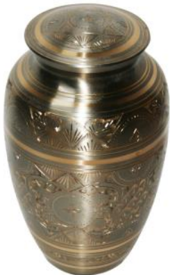
with "Sovereign" urn £240:00