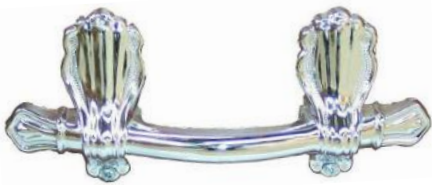
Set of Three Cast Metal Nickel Finished Doric Handles.