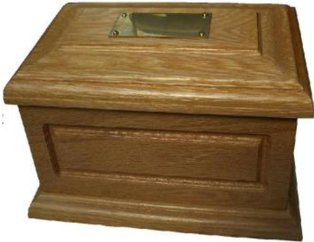
with Solid Oak Casket £195:00