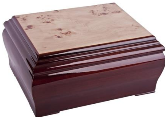
with Continental Casket £215:00