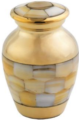
with Mosaic Urn £265:00