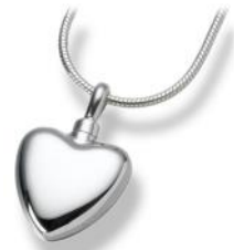
with Love Heart (no chain) £295:00

Our urn/casket prices include for the collection/ receiving of the ashes, for taking responsibility for them transferring them to the container safely and for storage at our premises for up to thirty days Subject to availability