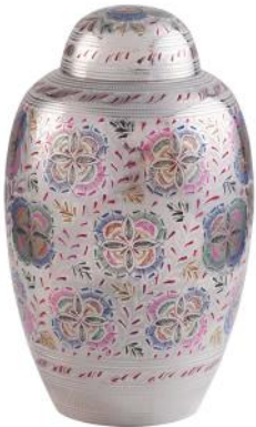
with "Grace" Urn £255:00