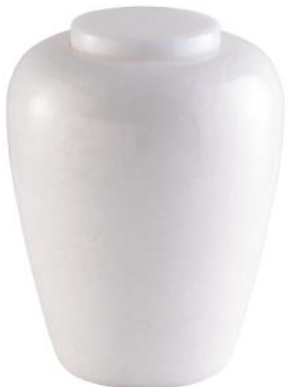
with "Simply Marble" Urn £245:00