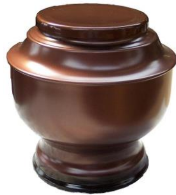
with Metal Spun Urn £165:00