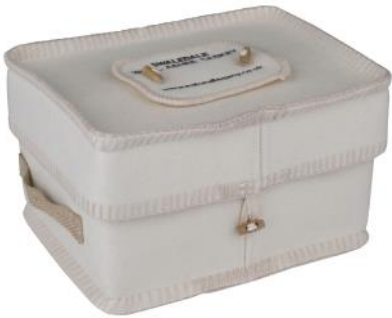
with White Woollen Urn £205:00