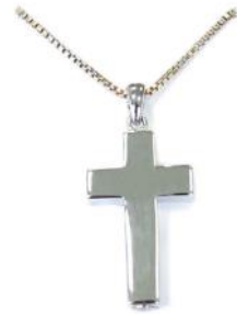
with Cross (with chain) £265:00