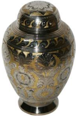
with Ambassador Urn £265:00