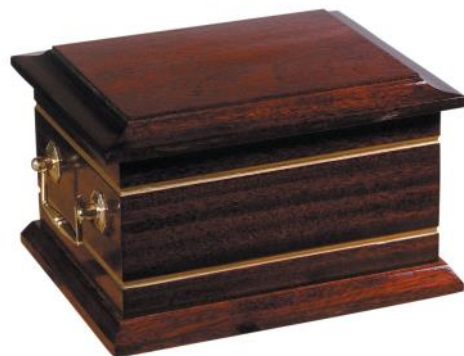
with Solid Wood "Lesbury" Urn £225:00

Our urn/casket prices include for the collection/receiving of the ashes, for taking responsibility for them transferring them to the container safely and for storage at our premises for up to two months.