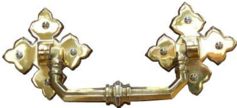
Set of Antique, Solid Brass Gothic Handles.£695:00