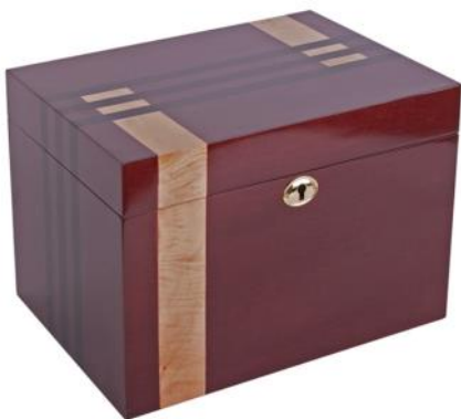
with Inlaid Wooden "Azure" Casket £235:00