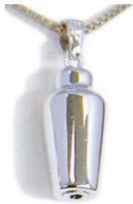
with Mini Urn Pendant (no chain) £265:00