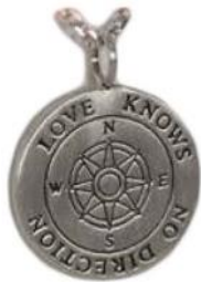
with Compass (with chain) £180:00