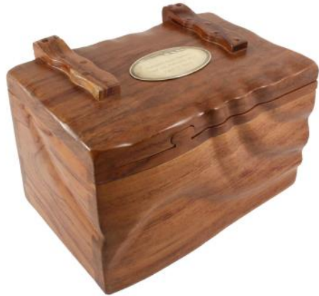
with Solid Wood "Trent" Urn £295:00