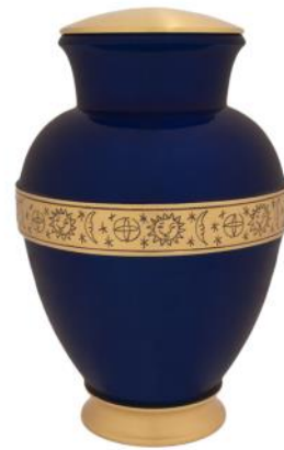
with Blue Harvest, Metal Urn £305:00