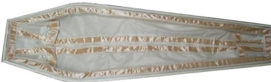
A Coffin Interior