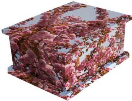
with Spring Blossom Casket £275:00