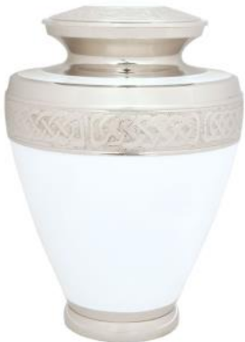
with Brass "Marble White" Urn £255:00