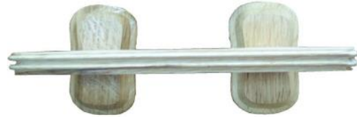
Set of Three Oak Bar Handles, and T-ends.£105:00