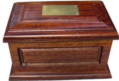
with Solid Mahogany Casket £195:00