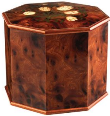
with Florence Urn £585:00