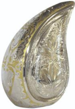
with Teardrop Patterned Urn £345:00 Inc. Keepsake - £425.00