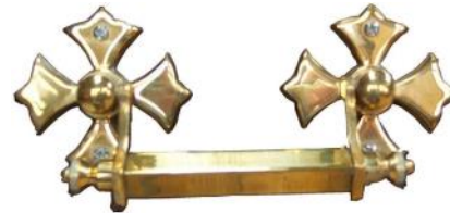
Set of Solid Brass Handles.£235:00